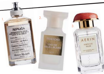
1. Replica Beach Walk, $155 for 100ml, MAISON MARGIELA, mecca.com.au 2. Soleil Blanc, $185 for 50ml, TOM FORD, davidjones.com.au 3. Hibiscus Palm, $175 for 50ml, AERIN, esteelauder.com.au/aerin; available March 11

New It-notes come and go in the fragrance world, but classics are so for a reason. Case in point: ylang-ylang. The tropical flower adds a sweet and aromatic hit to lighter scents, perfect for when you're not ready for wintry woody ouds and still want to smell like summer. Find it in these fresh spritzes.