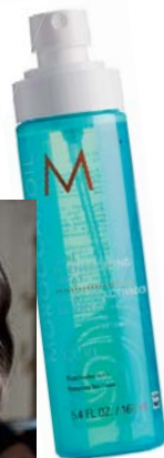
Curl Re-Energizing Spray, $56.95, MOROCCANOIL, moroccanoil.com/au