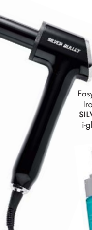
EasyCurl Curling Iron, $99.95, SILVER BULLET, i-glamour.com