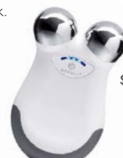
Trinity Mini, $292, NUFACE, mecca.com.au