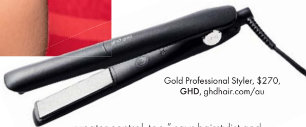
Gold Professional Styler, $270, GHD, ghdhair.com/au