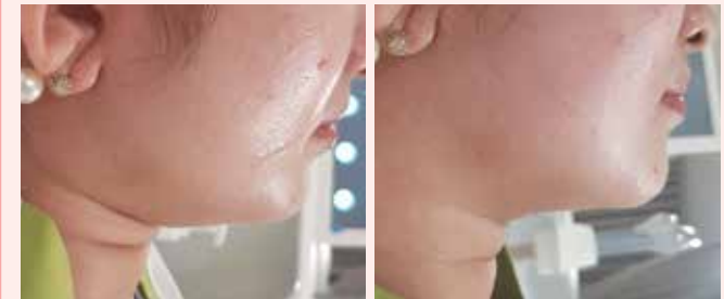
Before and after skin tightening