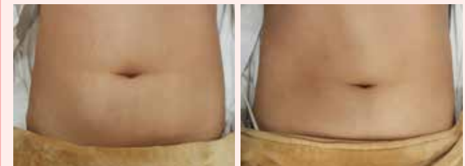
Before and after body tightening