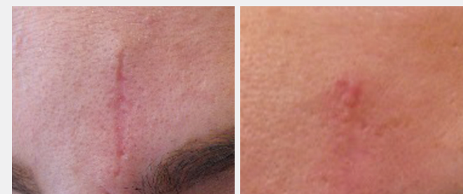
Before and after atrophy scar after 1 session