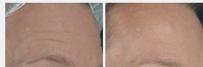
Before and after wrinkles