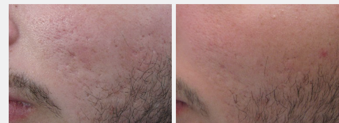
Before and after acne scars and enlarged pores