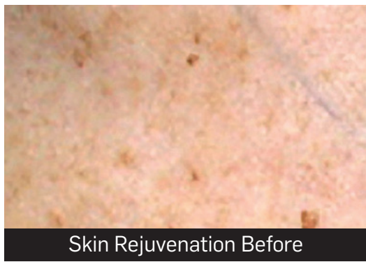
Skin Rejuvenation Before