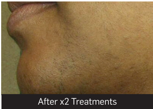
After x2 Treatments