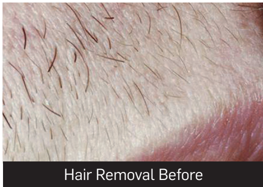
Hair Removal Before