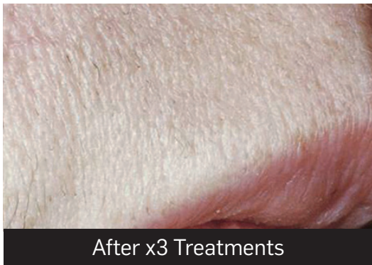
After x3 Treatments