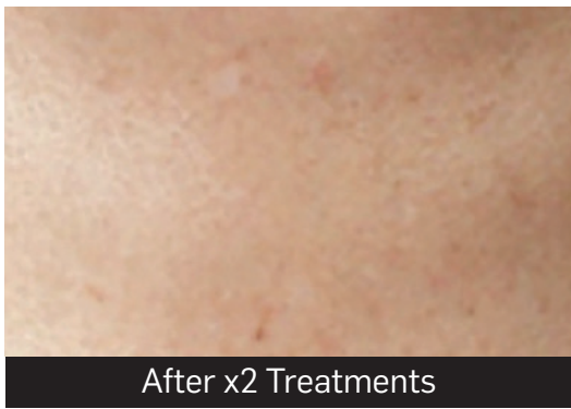
After x2 Treatments