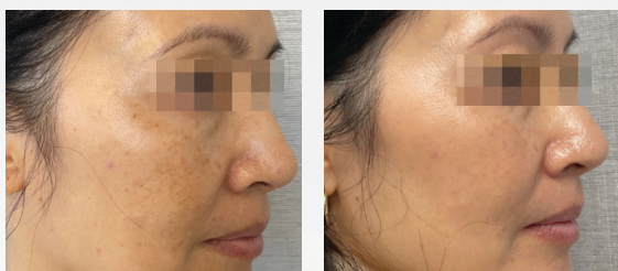
Before and after 2 treatments