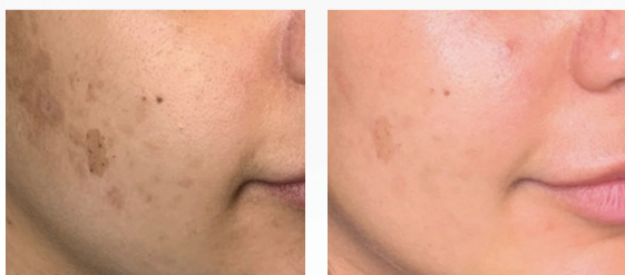
Before and after 2 treatments