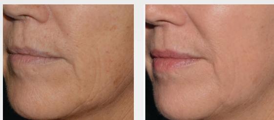
Before and after 2 treatments