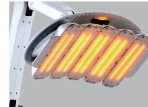
830 nm with 590 nm photosequencing

With three available treatment heads, there is one that is right for your treatment needs. Ask your doctor which Healite II wavelength is right for you.