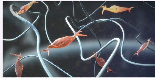
Fibroblasts before (above) and after (below) treatment