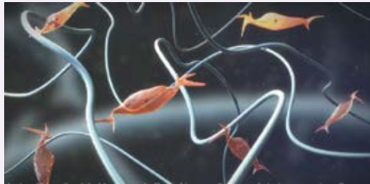
Fibroblasts before (above) and after (below) treatment