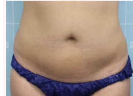
Patient with abdomen fat.