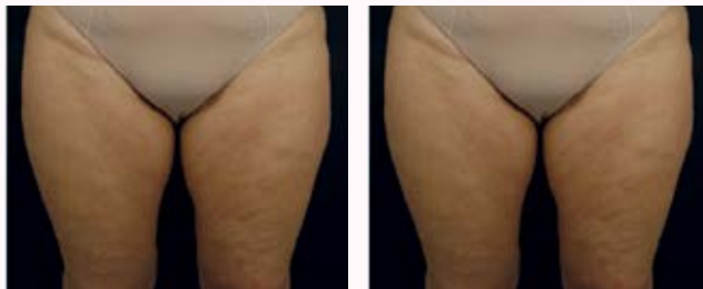
Patient: 58-year-old woman with soft cellulite and sagging skin. Before (left) and after (right) 4 dalyance treatment sessions.