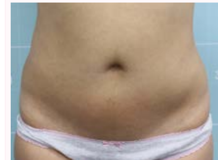
Before (left) and after (below) dalyance treatment.