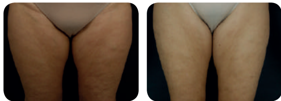
58 years old woman. Soft cellulite and sagging. After 4 sessions.