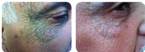
72 years old man. Deep wrinkles and cutaneous elastosis grade IV. After 5 sessions.