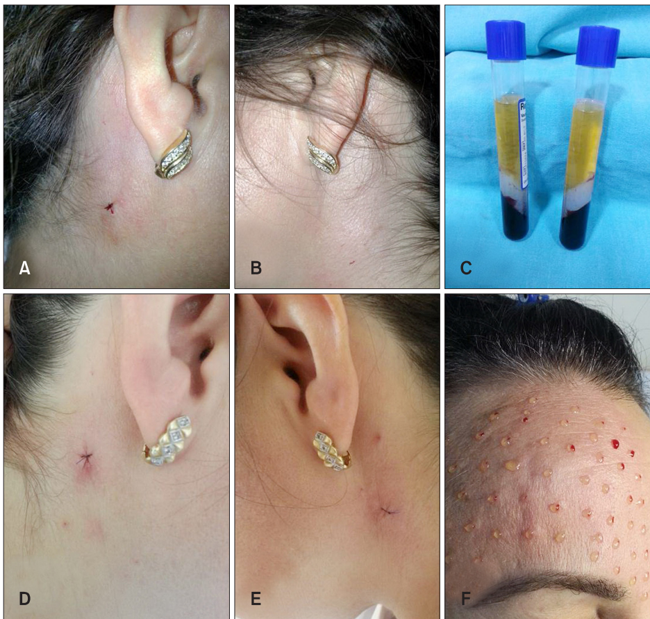
Fig. 1. The first biopsy was obtained from the right infra-auricular area before treatment (A). Saline was injected to the left infra-auricular area (B). Platelet-rich plasma (PRP) (C) was injected to the upper site of this right infra-auricular area (A) and face (F). On day 28 after PRP and saline injections, punch biopsy was performed on PRP (C) injected to the upper site of this right infra-auricular area (D) and control (saline injected area) site (E).