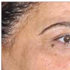
AFTER 3 WEEKS