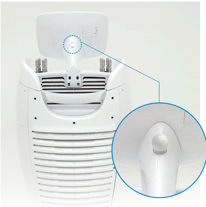
Remaining Count Display