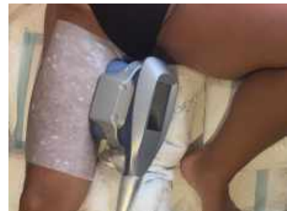
Inner Thigh Frontal