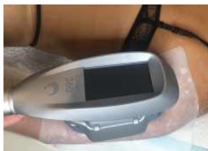
Arm Variation 2