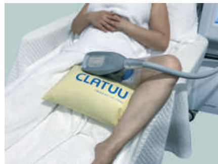
Inner Thighs Central