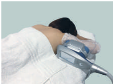
Arm Variation 1