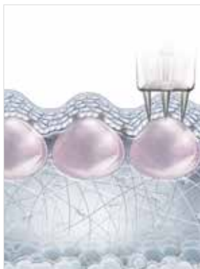
2/ Creation of a papula