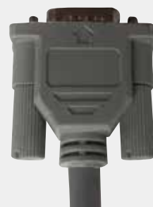
Monitor Cable (Attached to Main Body)