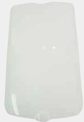
Cartridge Storage Lid