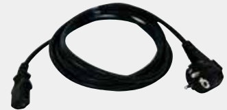
AC Power Cable